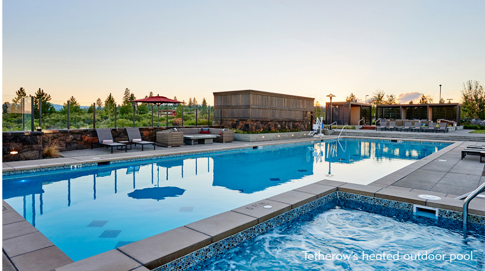
Tetherow's heated outdoor pool