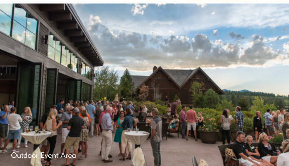
Outdoor Event Area