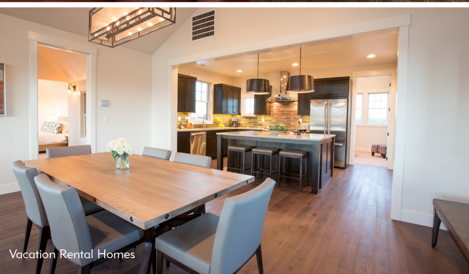
Vacation Rental Homes