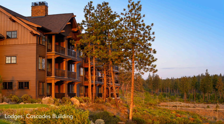
Lodges: Cascades Building