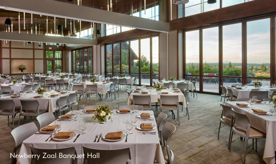
Newberry Zaal Banquet Hall