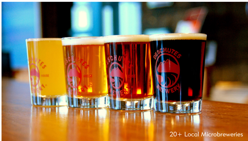
20+ Local Microbreweries