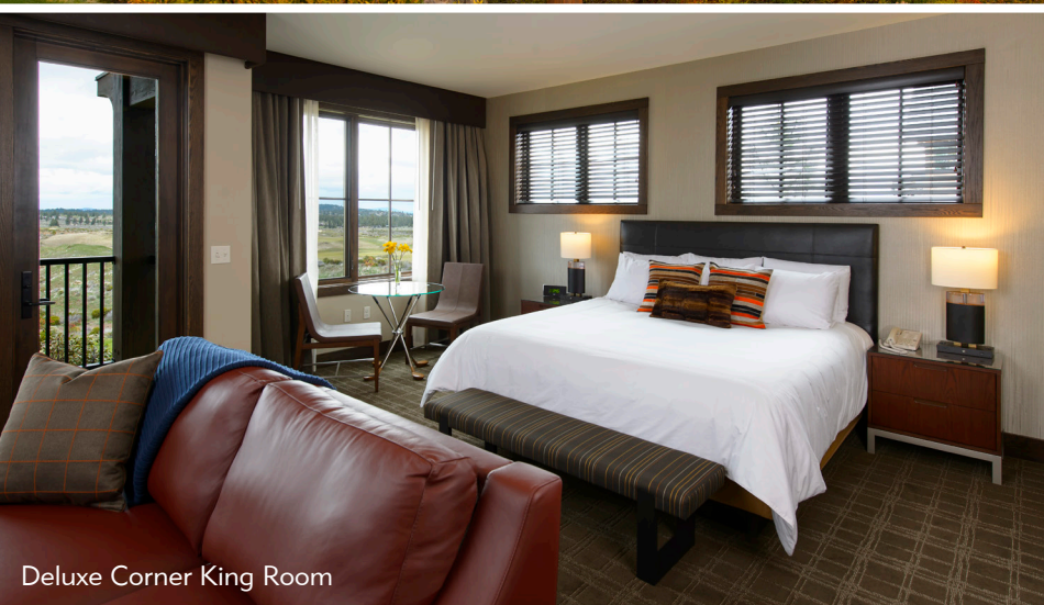
Deluxe Corner King Room