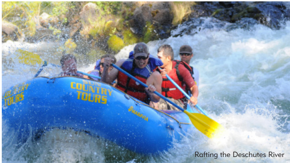
Rafting the Deschutes River