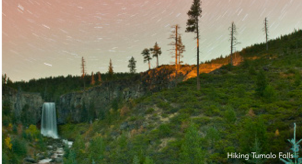
Hiking Tumalo Falls