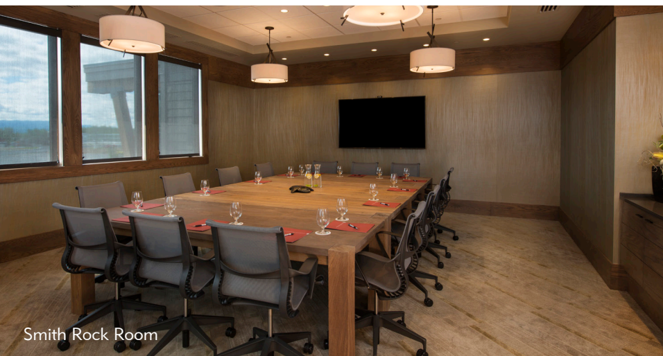
Smith Rock Room