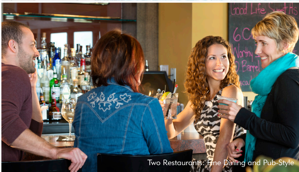
Two Restaurants: Fine Dining and Pub-Style