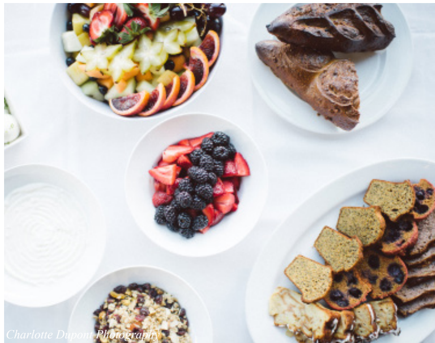
Charlotte Dupont Photography