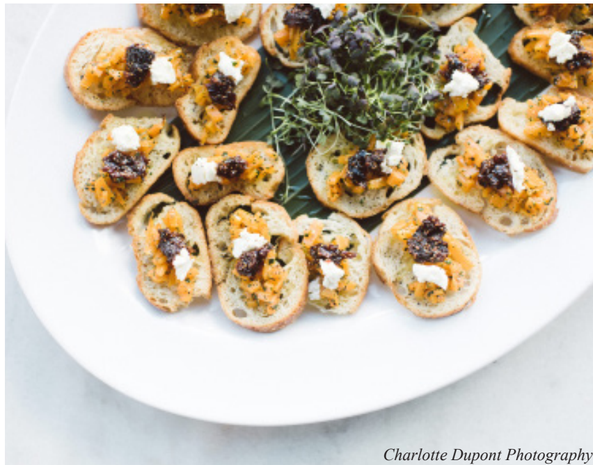
Charlotte Dupont Photography